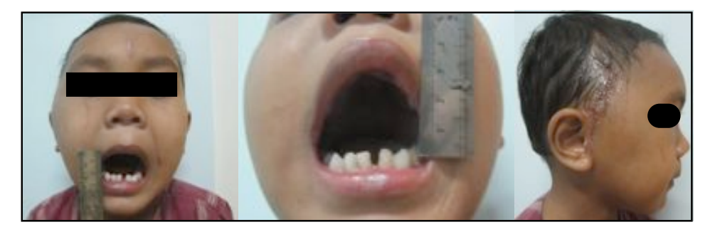
Figure 4 . Case 1 : Two weeks after surgery. Left: Anterior view. Middle: The patient could open his mouth 4 cm wide. Right: Lateral view of case 1. There was no pain or other complication noted.