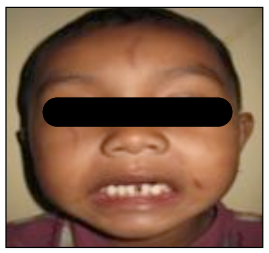
Figure 1. Pre-operative condition, the patient could not open his mouth at all.