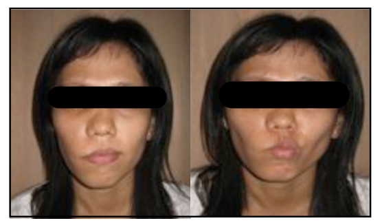
Figure 5. Pre-operative condition of case 2. Note the right facial nerve palsy she had.