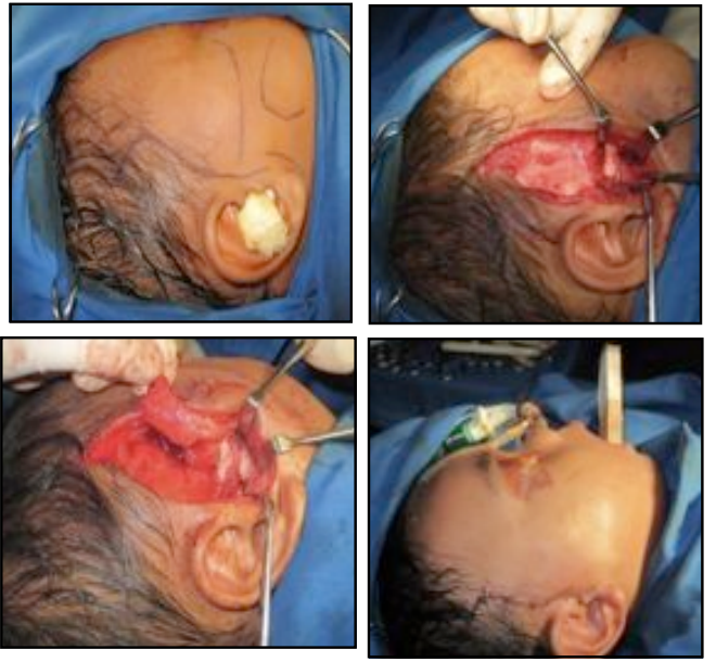
Figure 3. Above Left: Intra operative design. Above Right: The fusion of TMJ joint. Below Left: Temporalis muscle flap was placed between condyle and the glenoid fossa. Below Right: Post operative condition, we placed wooden stick to keep mouth opened.